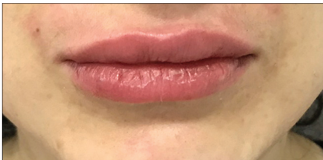
Figure 2: A 32-year-old female asking for lip augmentation. Lip bumps were detected 7 days following HA injections

VAS score, statistically confirmed, was 8.4 on average, ranging from 7 to 10. Evaluation under 7 was not recorded. No major complications, nor minor such as nodules were recorded.