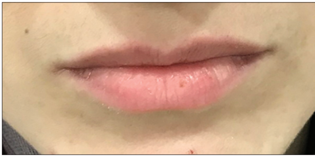
Figure 1: A 32-year-old female asking for lip augmentation. Pre-injection

VAS score, statistically confirmed, was 8.4 on average, ranging from 7 to 10. Evaluation under 7 was not recorded. No major complications, nor minor such as nodules were recorded.